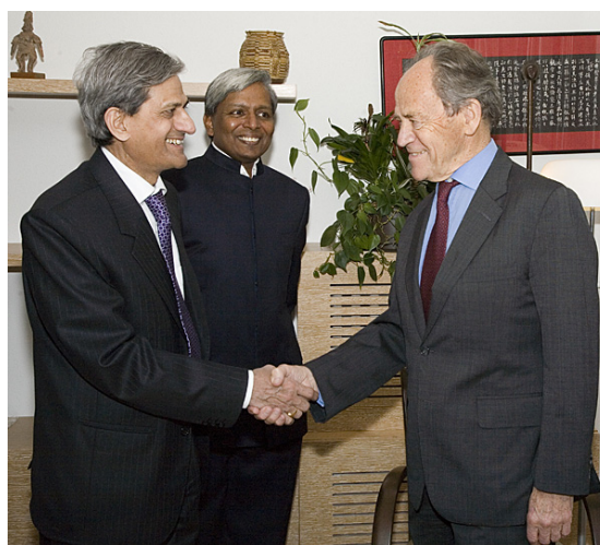
Torsten Wiesel welcomes the new Indian Board members

The Human Frontier Science Program Organization was founded in 1989 to support international research and training at the frontier of the life sciences. Until now it has been supported by contributions from the G7 nations, Switzerland, Australia, New Zealand, Republic of Korea and the European Union. With its collaborative research grants and postdoctoral fellowship programs it has supported almost 5000 scientists